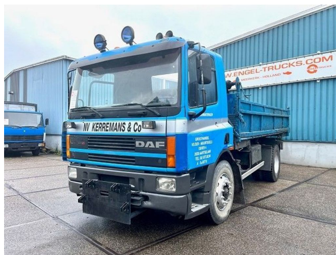
DAF 65.210 ATI 4x2 FULL STEEL KIPPER (EURO 2 / MANU...