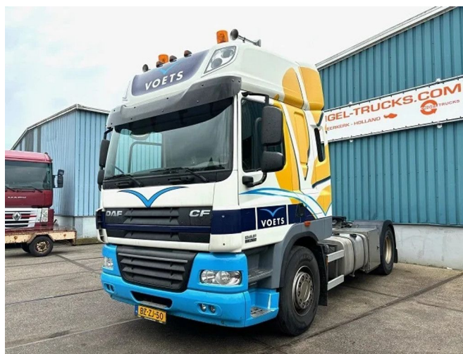
DAF CF 85 360 SPACECAB (ORIGINAL DUTCH TRUC... 4x2 Referentienummer: SN 56595011