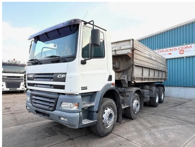
DAF CF 85.430 8x4 FULL STEEL 20m3 KIPPER (EURO 3 / ...