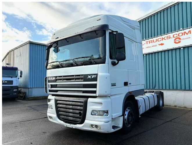
DAF XF 105.460 SPACECAB (ZF MANUAL GEARBOX / ... 4x2 Referentienummer: SN 57332409