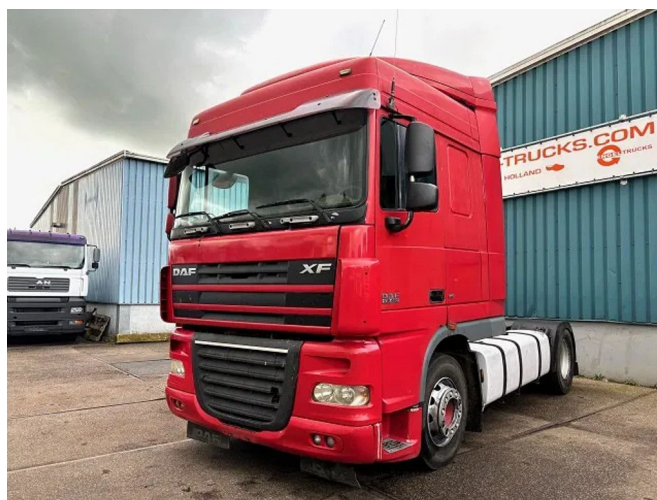
DAF XF 105.460 SPACECAB (ZF16 MANUAL GEARB... 4x2