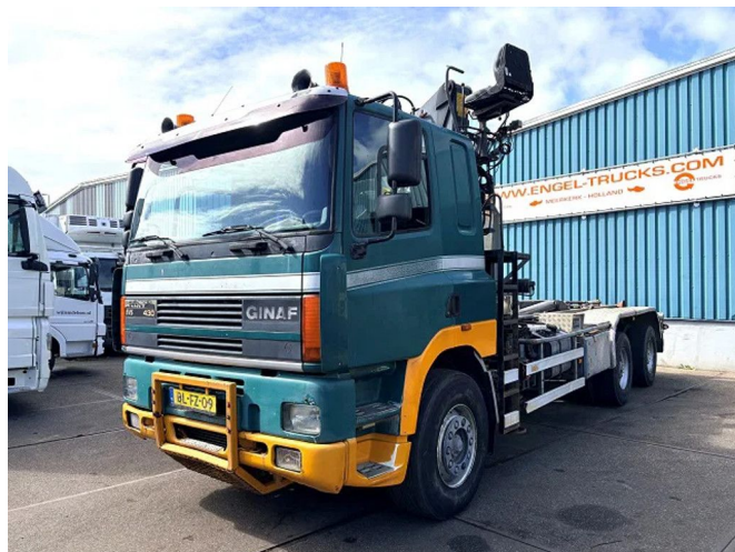
Ginaf M 3232 S 6X4 WITH LOGLIFT F105Z 27A & LEEBUR ...