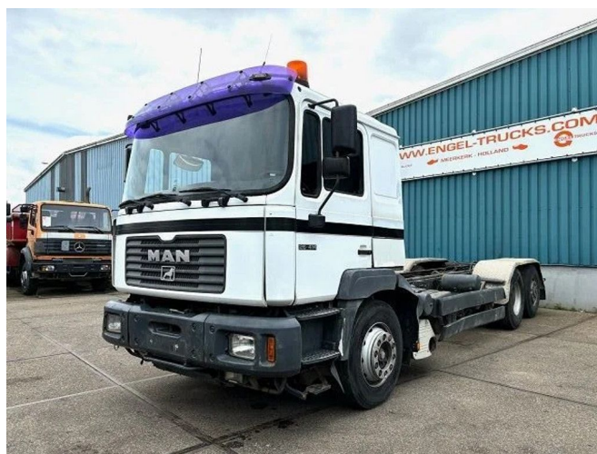
MAN 26.414 FNL-T (6-CILINDERHEADS) 6x4 CHASSIS (EU...