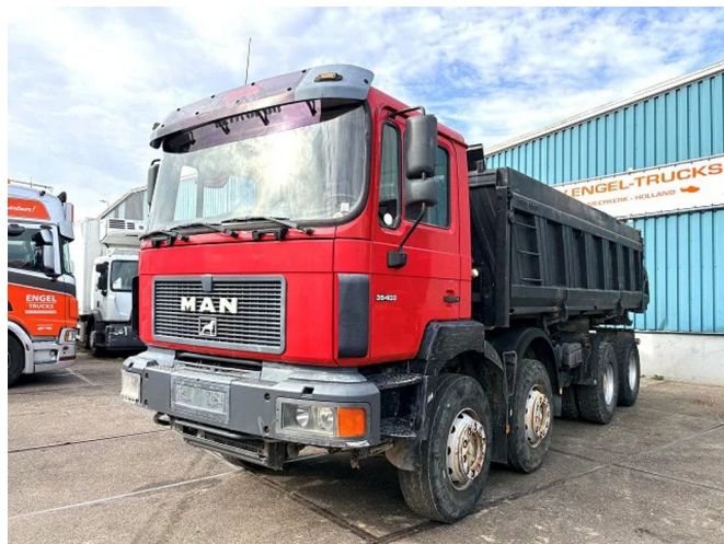
MAN 35 .403DF 8x4 MEILLER KIPPER (EURO2 / ZF16 MA...