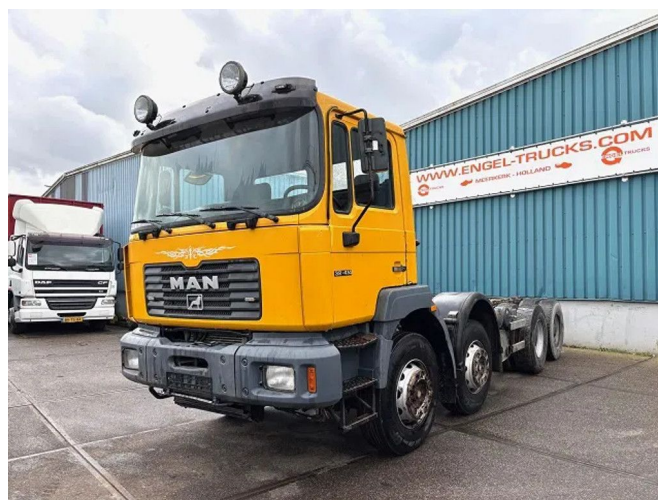
MAN 35.414 VF-TM 8x4 FULL STEEL CHASSIS (6-CILINDER... Referentienuummer: SN 57820506