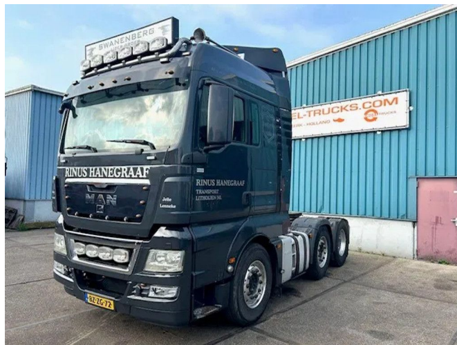
MAN TGX 26.480BLS XLX 6x2 (ZF16 MANUAL GEARBOX / ...