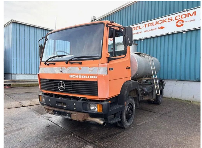
Mercedes-Benz 914 KO RHD 4x2 FULL STEEL TANK TRUCK... Referentienummer: SN 57816153