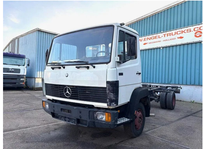
Mercedes-Benz LK 814 6-CILINDER FULL STEEL SUS... 4x2 Referentienumer: SN 57797229