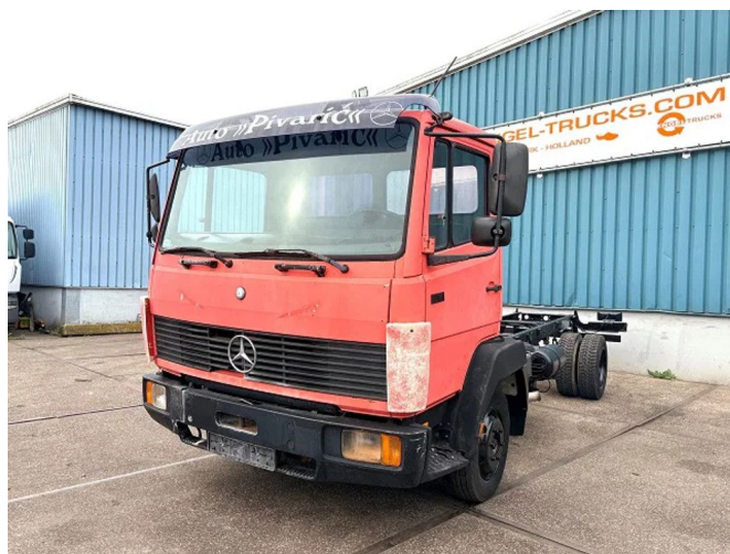
Mercedes-Benz LK 814K 4x2 (6-CILINDER) FULL STEEL C...