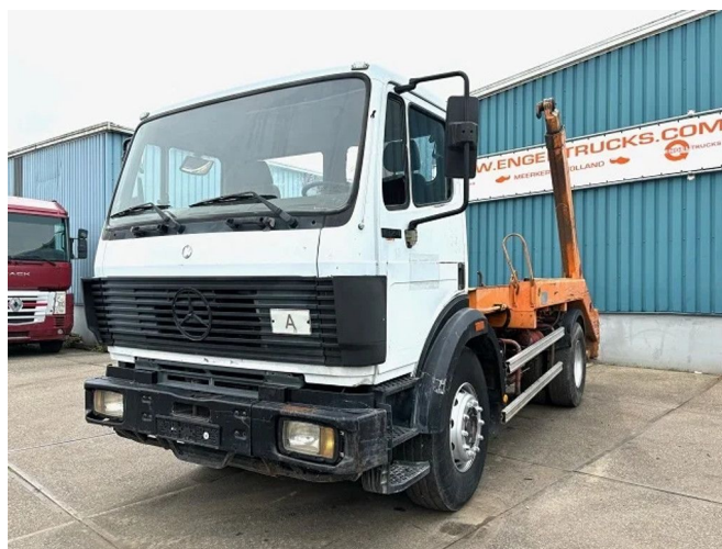
Mercedes-Benz SK 1824 K 4x2 FULL STEEL CHASSIS WITH...