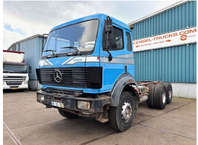
Mercedes-Benz SK 2527 6x4 (V6-ENGINE) FULL STEEL SU...