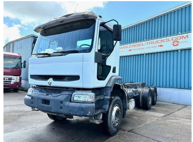
Renault Kerax 320 6x4 FULL STEEL CHASSIS (MANUAL G...