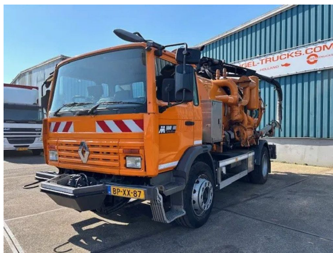
Renault Midliner 180 -15/D RHD WITH RAVO KZ7082/1... 4x2 Referentienummer: SN 58023559