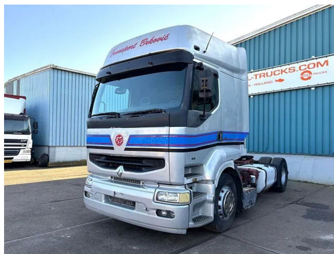
Renault Premium 400 .18T ROUTE 4x2 (POMPE MANUELLE...