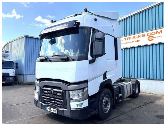
Renault T460 HIGH (EURO 6 / I-SHIFT / RETARDER / ... 4x2