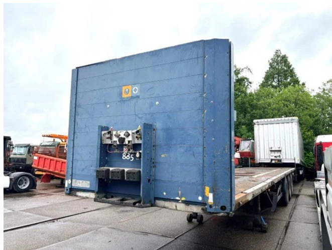
Schmitz Cargobull SCS 24/L 3-AXLE FLATBED TRAILER (D... Referentienummer: SN 60355362