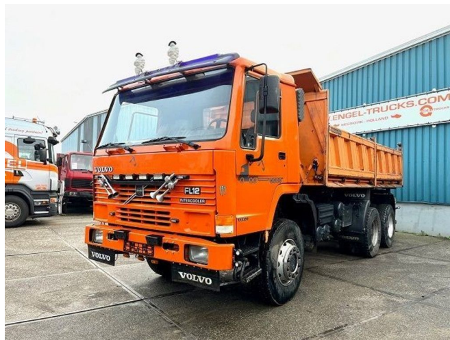
Volvo FL 12.380 6x6 FULL STEEL SUSPENSION MEILLER K... Referentienummer: SN 53819343